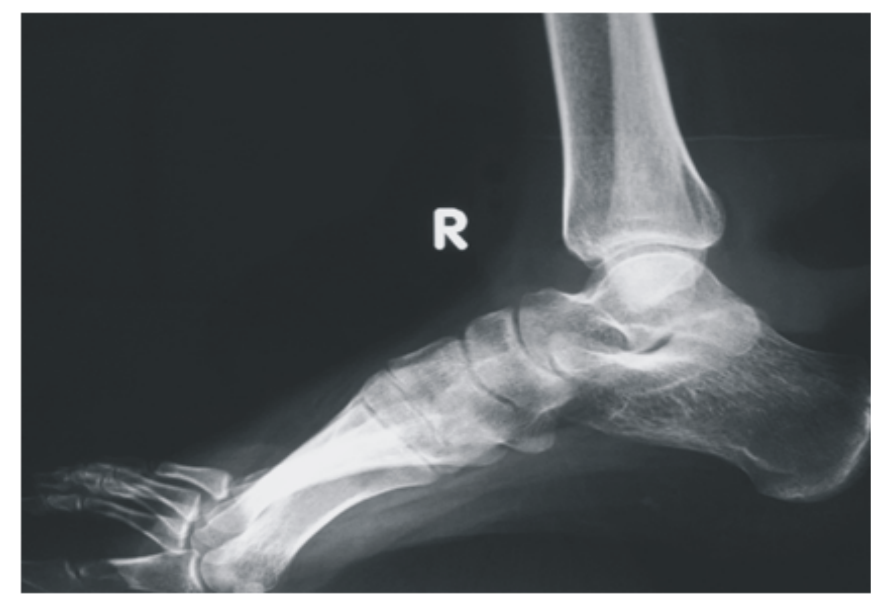
Fig 1: Lateral view showing (arrow head) area of involvement.

Physiotherapy for ankle range of motion with hot saline fomentation was advised after 3 months. Partial weight bearing was allowed 4 months after the operation and full weight bearing was allowed after 9 months. At the end of the complete treatment patient had full and painless motion at the ankle and subtalar joint.